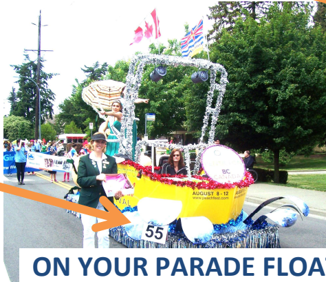
ON YOUR PARADE FLOAT

LAMINATED PARADE NUMBERS MUST BE DISPLAYED on the right side of your entry for identification by parade officials and announcers. There will be tape on the numbers.