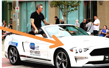
ON YOUR HEADLIGHT