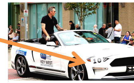
ON YOUR HEADLIGHT