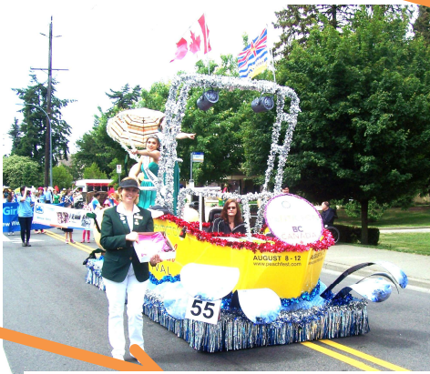
ON YOUR PARADE FLOAT

LAMINATED PARADE NUMBERS MUST BE DISPLAYED on the right side of your entry for identification by parade officials and announcers. There will be tape on the numbers.