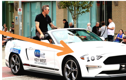
ON YOUR HEADLIGHT